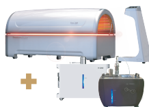
Whole-Body PBM Therapy and Hydrogen Inhalation Therapy